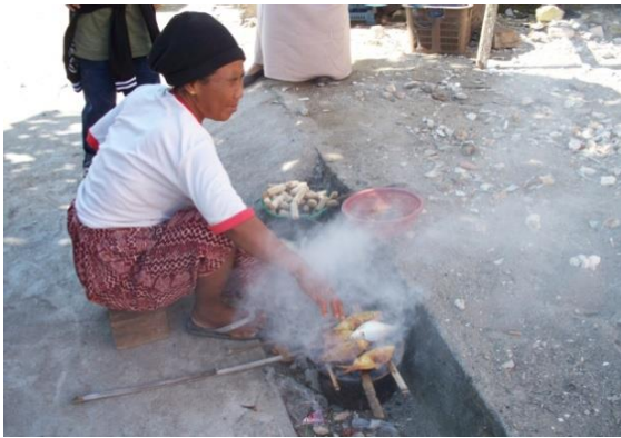
Fig 1. Tools for fish fumigation in previous situation [13].