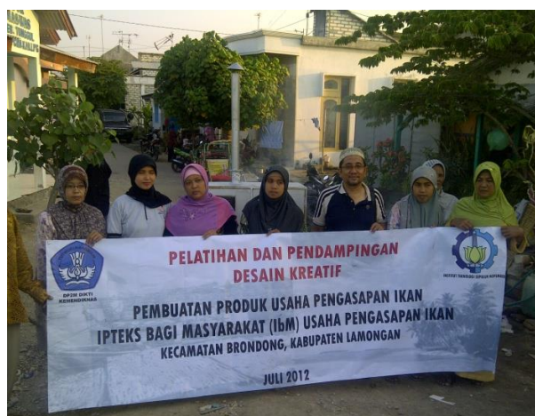
Fig 9. Participants of the program

The ESM (Ergonomics Smoke Machine) supports fisherwomen as a cottage and coastal industry and decreases the likelihood that women will be forced to seek jobs outside their community. Furthermore, the grassroots approach benefits the entire community. By adding the ESM to their product line, welder can increase their incomes and gain satisfaction from making and selling a product that helps their own people. Another benefit is that the welder can use their increased awareness of ergonomics to improve their own working methods.