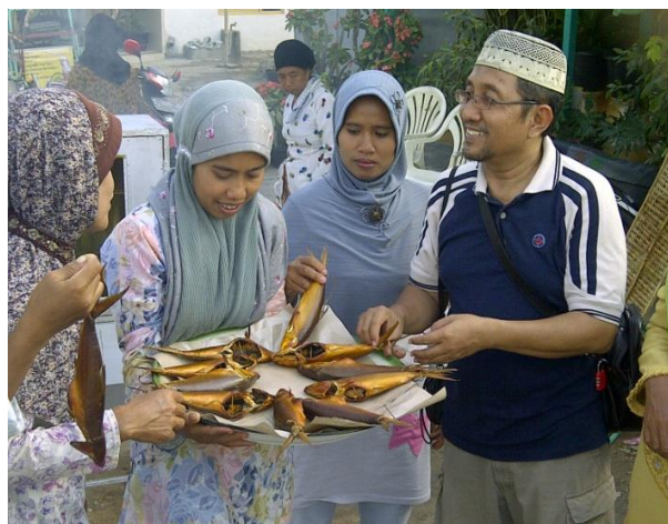
Fig 8. The smoked fish is ready to be served