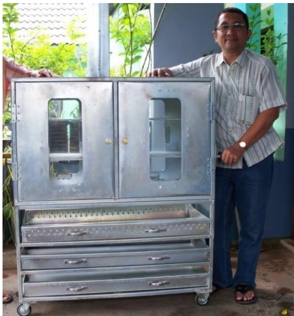
Fig 4. Ergonomic, mobile and portable fish smoke machine.