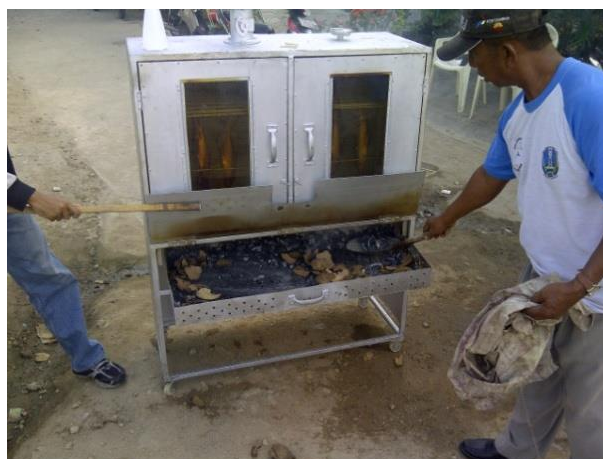
Fig 5. Fishermen test the prototype during the IbM fish cultivation business in Sub-District Brondong in Lamongan city

Appropriate Technology of Fish Curing Tool is an effective tool to process fish into smoked fish. By using the tool, the Business Group Development of Smoked Fish in Sub District Brondong in Lamongan can run more optimally. From these tools can be smoked various types of fish, chicken, duck and other types of smoke ingredients. And can help people to recognize the smoke fish technology as an alternative to self-employment. Improving community skills is a fish-smoking skill that can be practically demonstrated by the following figures (Figures 5-9):