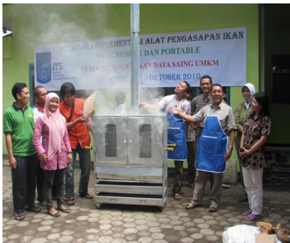
Fig 6. People processing curing fish