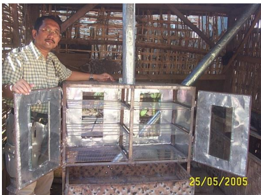
Fig 2. Ergonomic smoke fish tools when first time founded by ergonomic designer [13].

The purpose of this activity are (a) Designing ergonomic smoke machine for fishermen that are mobile, portable and environmentally friendly; (b) Implementing the science of health and safety so as to increase knowledge to the community; (c) Increasing employment in fishery products processing business; (d) With this activity can foster the interest of the community to entrepreneurship for those who have not started a business and will increase its business for those who have started the processing business of fishery processing.