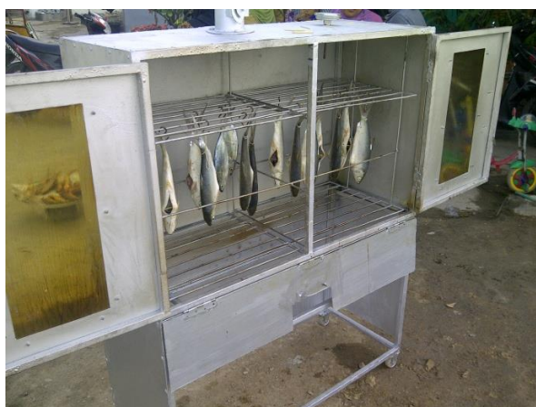
Fig 7. (a) Fish before it is smoked