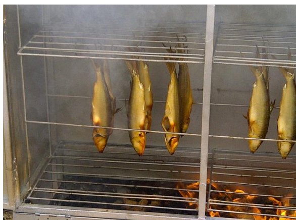
Fig 7. (b) Fish after it is smoked