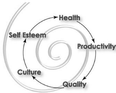
Fig 10. The elements of this ergonomics cycle of benefits apply universally, bringing all products an evolving sense of self-confidence, a connection with their cultural heritage, and development of their unique creative gifts of local wisdom products [15].